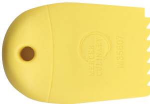
M35607 Saw Tooth