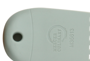
M35613 5mm Square Notch - 5 Gaps