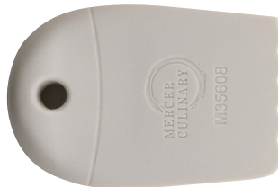
M35608 5mm Round Arch