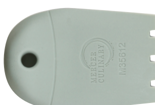
M35612 4mm Square Notch - 3 Gaps