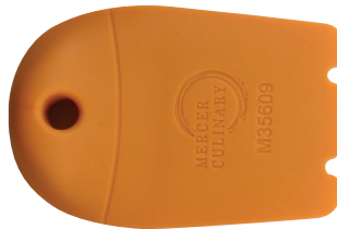
M35609 4mm Horseshoe Arch