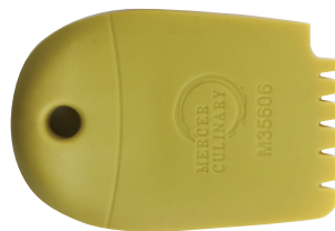
M35606 3mm Graduated Lancet Arch