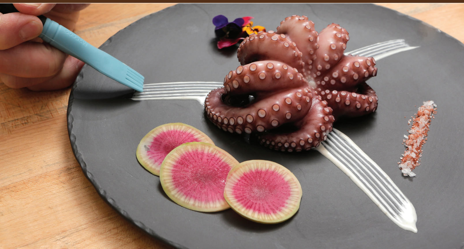
Lancet Arch Brush