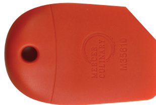
M35610 45° Angle